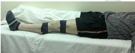
Fig.1: Measurement of knee flexion.

2. Measurement of Pain Severity: The intensity of knee pain was evaluated by the visual analogue scale (VAS) after patients had remained in a weight-bearing state for 5 minutes (walking or standing) [21].